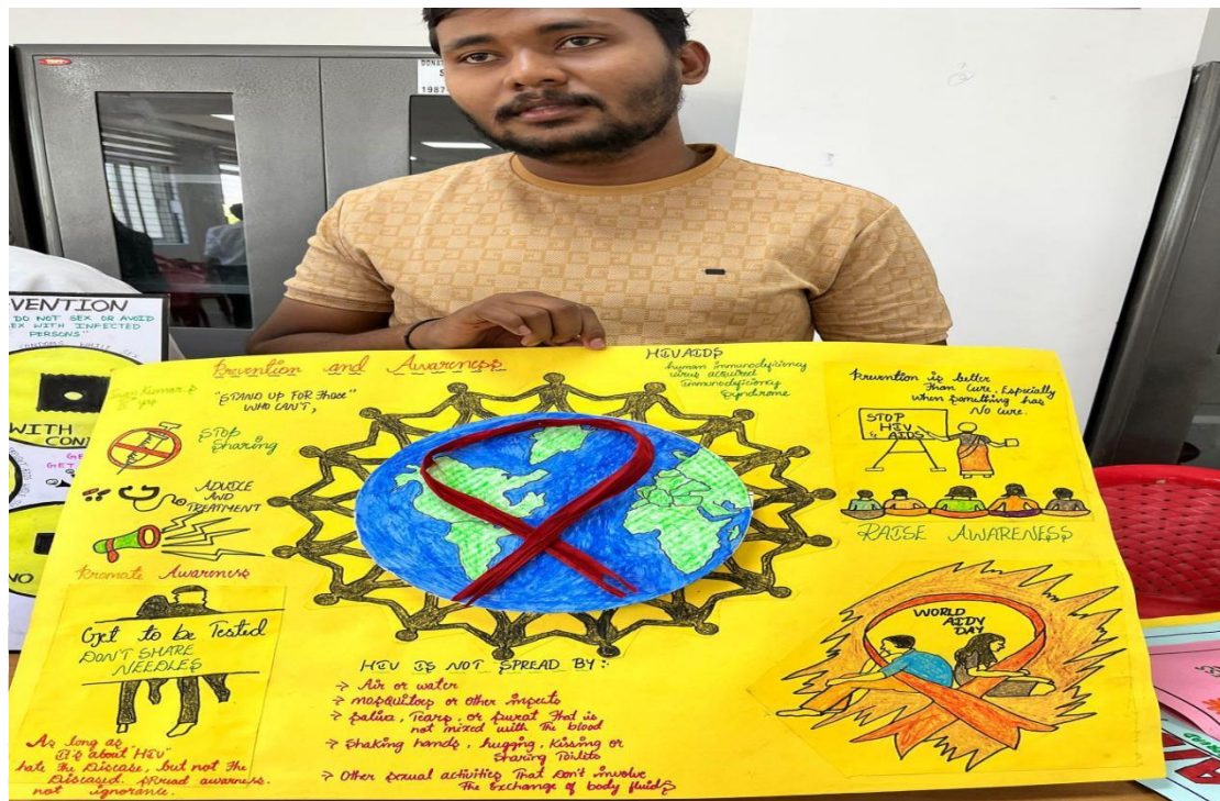
Third prize winner in the competition