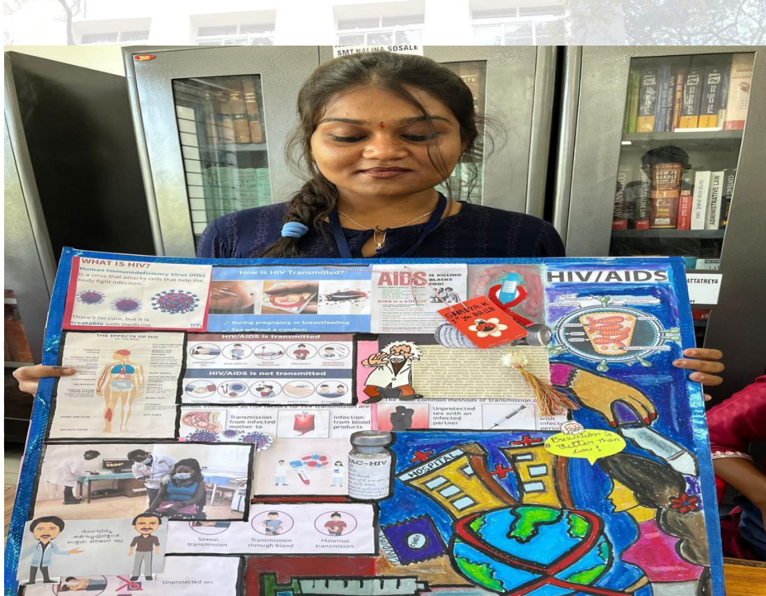
First Prize winner in the poster making competition