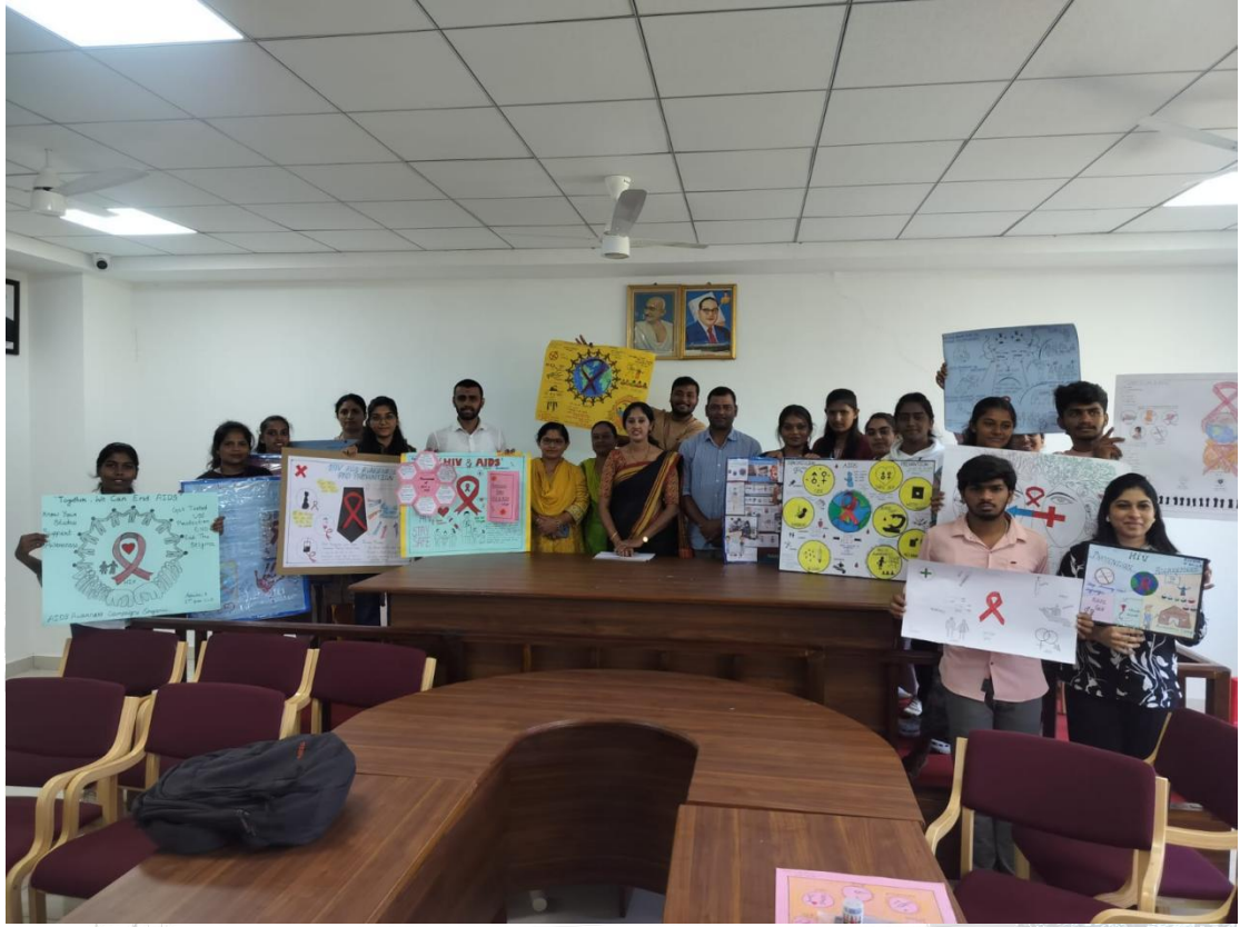
Group photos with participant