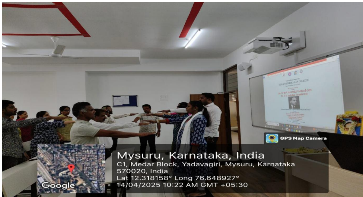
On this occasion recitation about preamble of the constitution