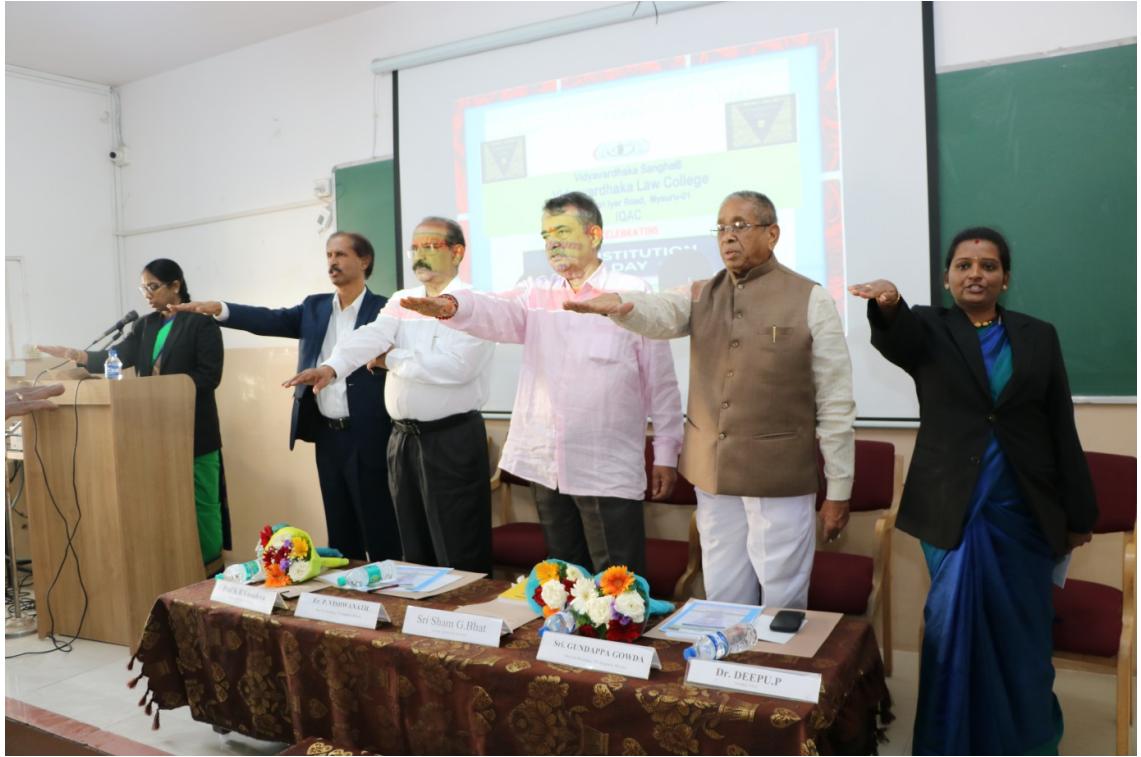
Our students also take part in reciting the preamble of our Indian Constitution.