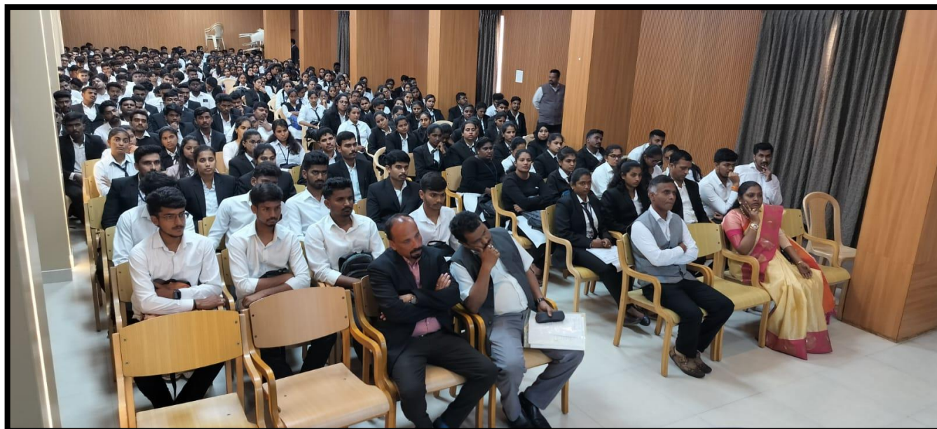
Audience of the Programme.

was recognized as the “Best Student of Vidyavardhaka Law College” on the basis of his versatility during his five years of law studies.