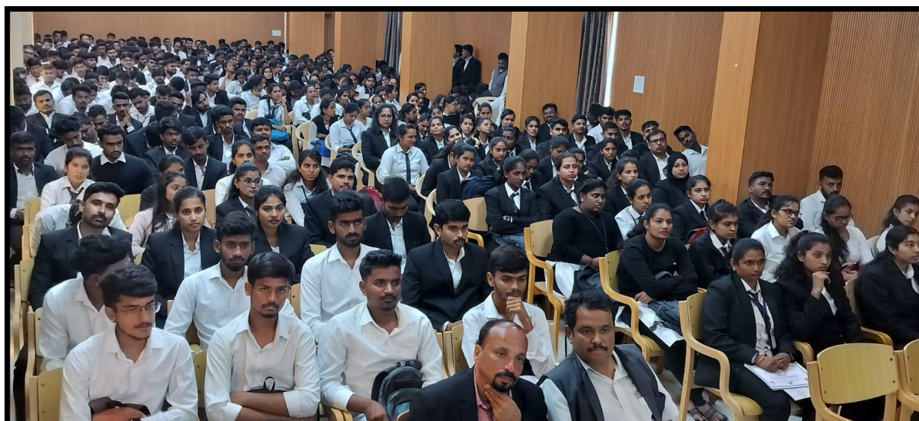
Audience of the Programme.