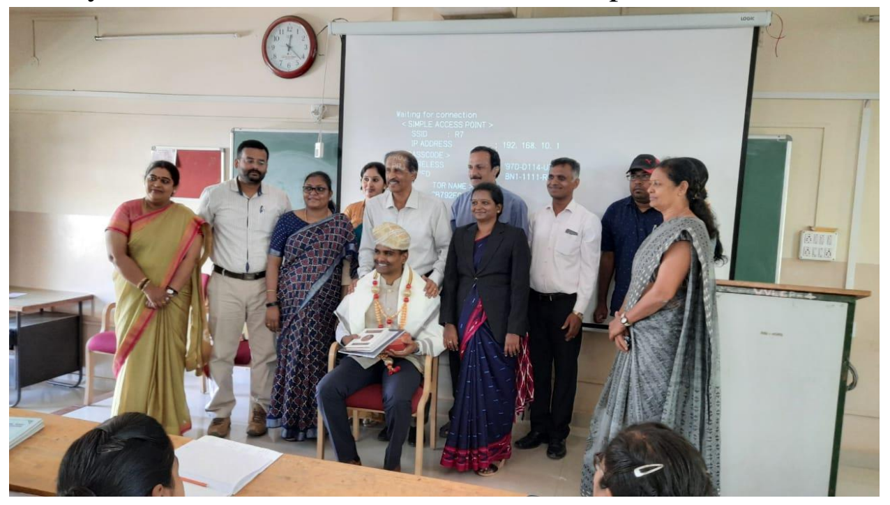
Finally our institution felicitate our resource person.

Vote of thanks held by the coordinator of career guidance cell.