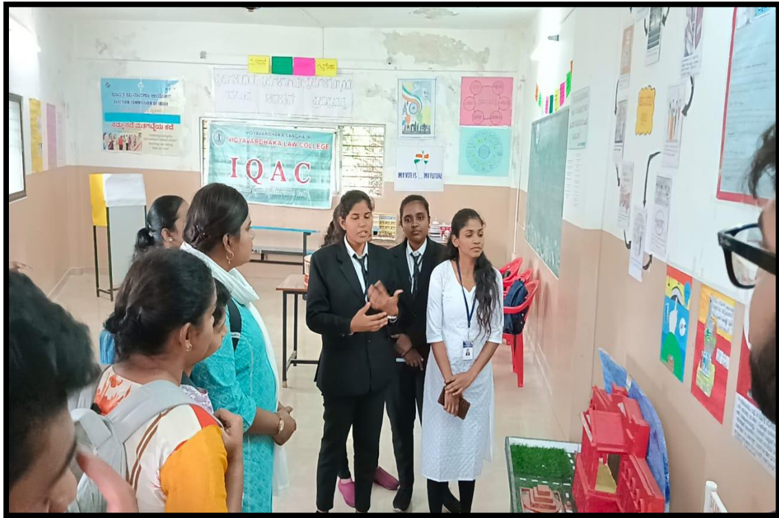
Student explaining about the process of election