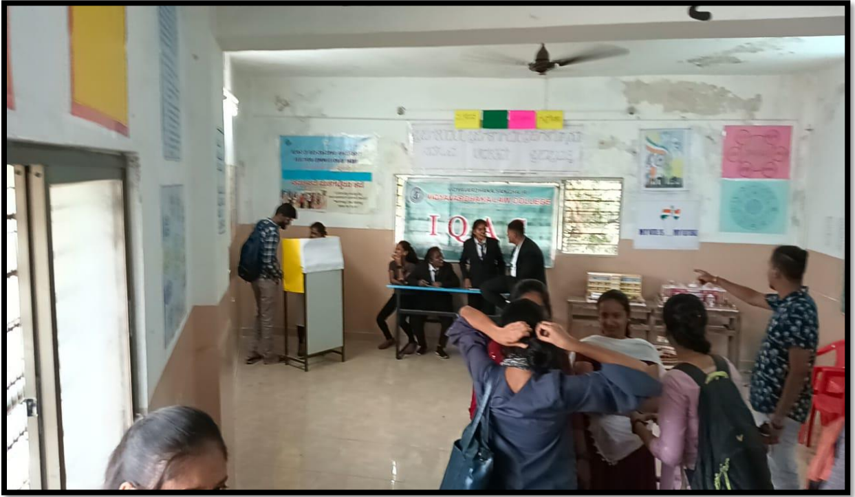
Mock polling instruction