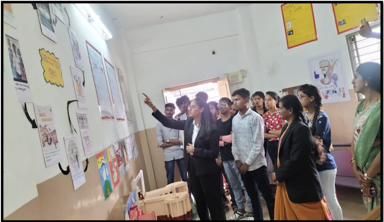
Student explaining about process of election and offence relating to election