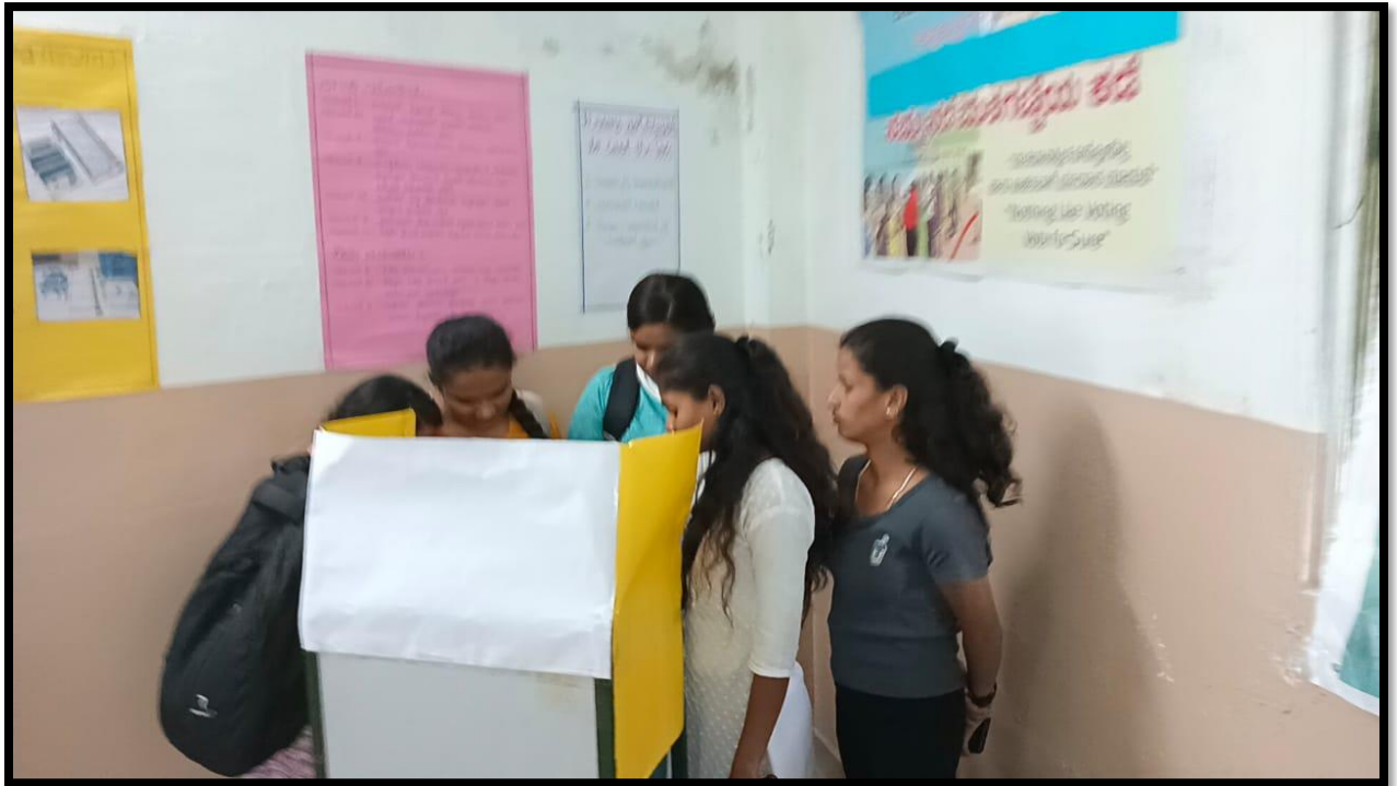
Demo Mock polling by the students