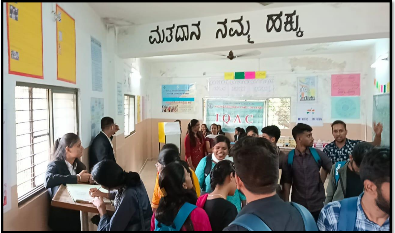
Student observing about election awareness exhibition