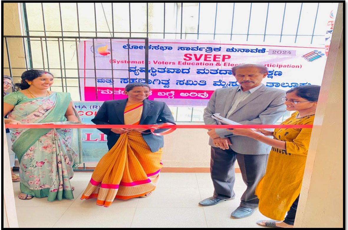
Inauguration of Democracy Room