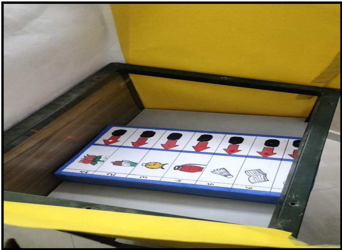
Model of EVM for Mock poll