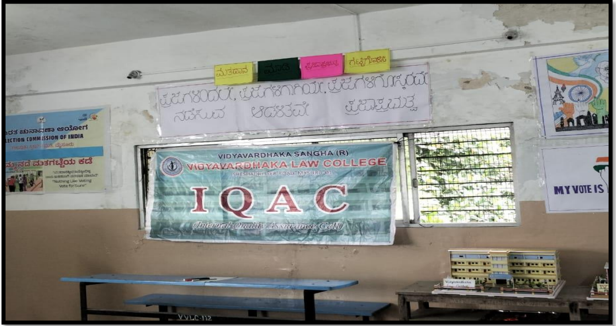
Democracy room with statement about democracy