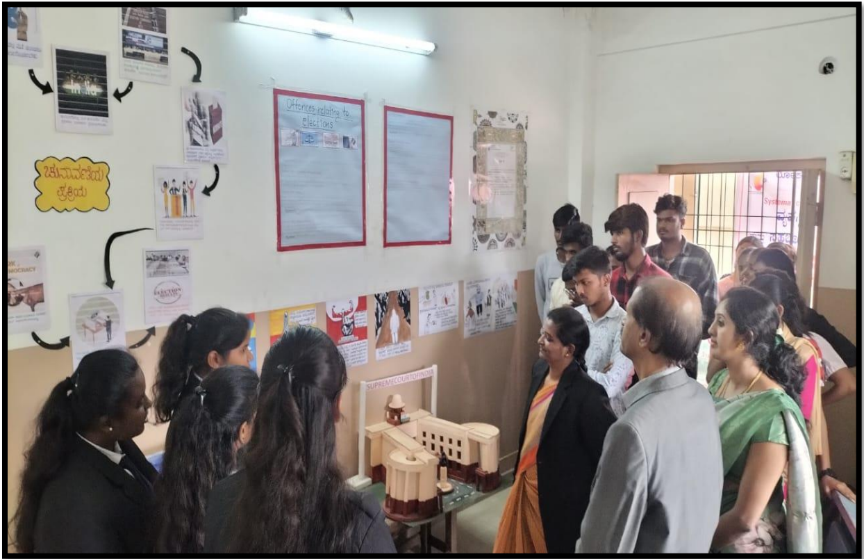
Election Awareness Exhibition was displayed