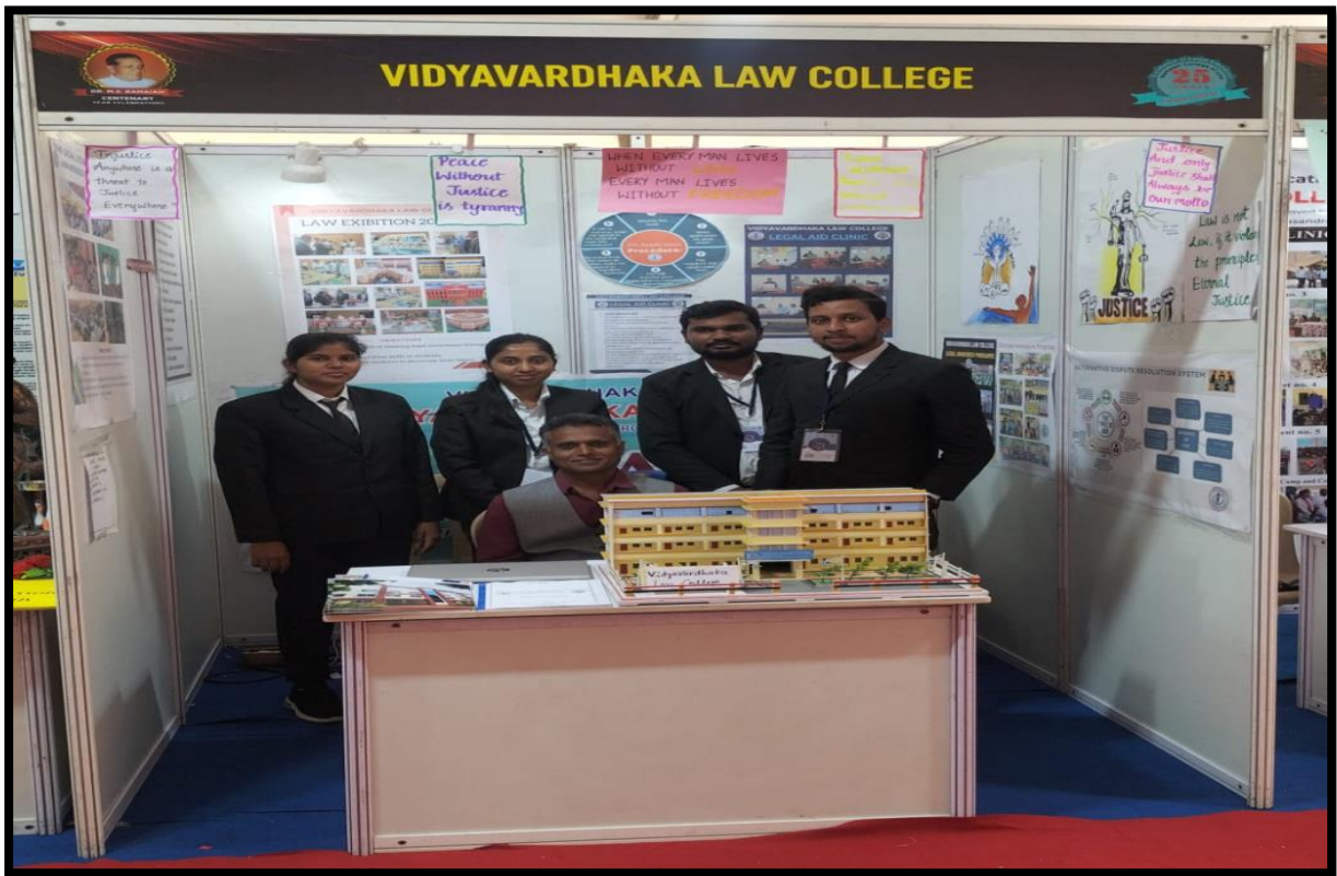
Our College Team is ready for presentation in front of Judges.