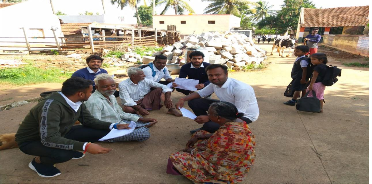
ಅಂತಿಮ ವರ್ಷದ ವಿದ್ಯಾರ್ಥಿಗಳು ಗ್ರಾಮಸ್ಥರ ಜೊತೆಯಲ್ಲಿ ಸಂವಾದದಲ್ಲಿ ತೊಡಗಿರುವುದು.