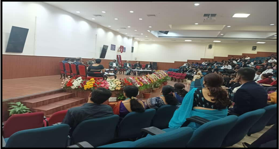
Teams from different Colleges participated in the Samvada.