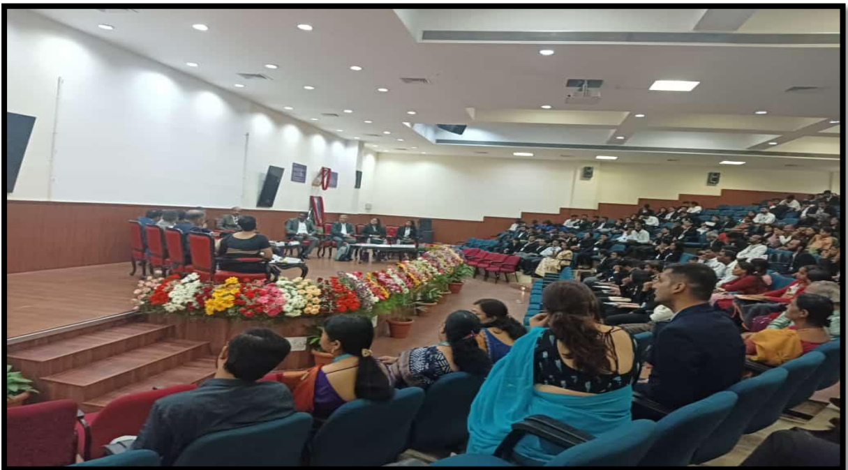
our Team participated in the Kannunu Samvada.