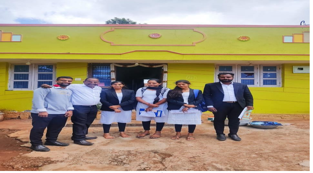
ವಿದ್ಯಾರ್ಥಿಗಳು ಮನೆ ಮನೆ ಸರ್ವೆ ಕಾರ್ಯದಲ್ಲಿ ತೊಡಗಿಕೊಂಡಿರುವ ಒಂದು ದೃಶ್ಯ.