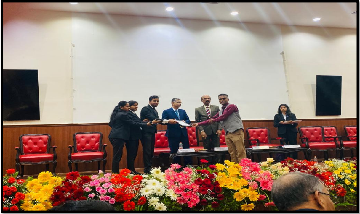
our Team receives Letter of Appriciation