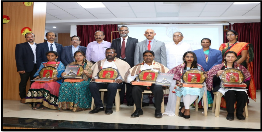
Felicitated to Rank Holders from 3yrs LL.B and 5yrs BA LL.B